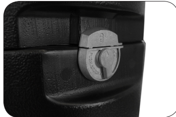
NEW push & turn locking mechanism