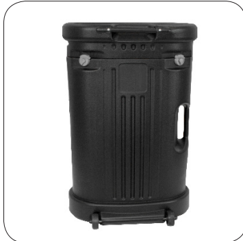
Recessed wheels and handle